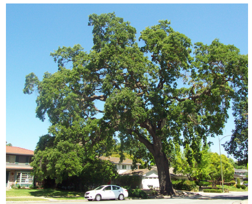
Right: Example of a heritage tree.